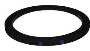
Buna Fuel Resistant