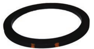
Buna N-Hot Oil 2 Orange Stripes