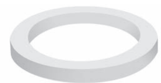
White Nitrile Food Grade