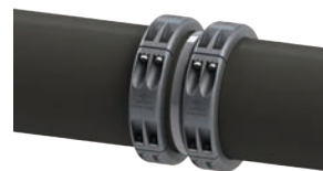
PTHM Assembly with HD2 Clamps