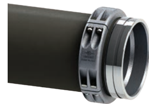
GSHD2 Assembly with HD2 Clamp