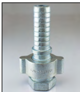
GROUND JOINT FEMALE 1

By replacing the female spud of a ground joint coupling with a double or male spud, hose to hose ground joint connections or hose to rigid connections are simplified. Double spuds for hose to hose connections are threaded NPS MALE X NPS MALE. (GJ wing nut is also NPS). For hose to rigid connection, the male spud is threaded NPS MALE X NPT MALE.